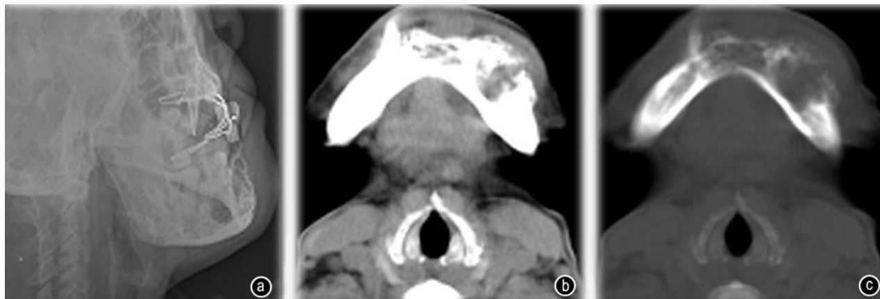
Fig. 2 The patient was a 50-year-old woman with maxilla hemangiomas. (a) DR showed maxilla irregular well defined bone destruction; (b) CT image obtained with a soft tissue window setting showed irregular bone destruction with poorly defined soft-tissue mass; (c) CT image obtained with a bone window setting showed irregular destruction with residual bone inside

MRI was performed in 20 patients. The lesions showed hypointense mainly in T1WI and hyperintense in T2WI in 16 patients. In 4 cases, the lesions showed hypointense mainly in T1WI and isointense and hypointense in T2WI. MRI with high soft tissues resolution showed margin and soft tissue mass of tumors clearly in 20 patients. The relationships between tumor, adjacent tissues, and organs were depicted clearly on the axial, sagittal and