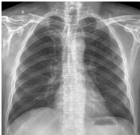
Fig. 1 The patient was a 59-year-old man with rib benign fibrous histiocytoma. DR showed local expansive well defined bone destruction in left eighth rib with ossification margin and nodular-like calcification inside and without obvious periosteal reaction

All MR studies were performed by using a 1.5-T superconducting magnet and a array body coil. The scan (4 mm slice thickness, 256 \times 256 matrix pixels, 24 \text{ cm} \times 38 \text{ cm} field-of-view) included transversal coronary and sagittal. The fast spin echo sequences (TSE) parameters for the T1 weighted imaging were TR = 616 ms, TE = 20 ms and T2 weighted imaging were TR = 4620 ms, TE = 103 ms. The fat suppressed sequence parameters for T2 weighted imaging were TR = 4940 ms, TE = 103 ms, and TI = 140 ms.